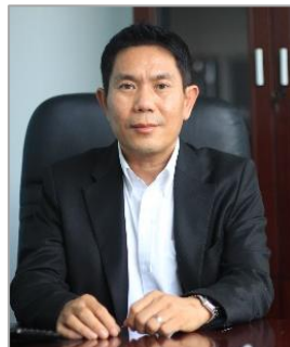
Chief Operating Officer of SVN (COO)