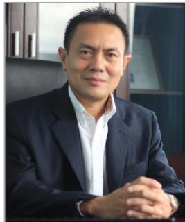
Chief Financial Officer of SVN (CFO)