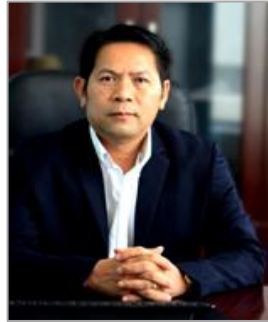
Chief Executive Officer of SVN (CEO)